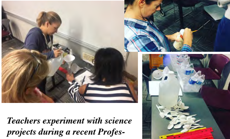
Teachers experiment with science projects during a recent Professional Development session.

This year we have focused on Writing, Mathematics, Science and English Learners. Teachers engage in understanding good instruction and the curriculum we have in place to address each of our various state standards.